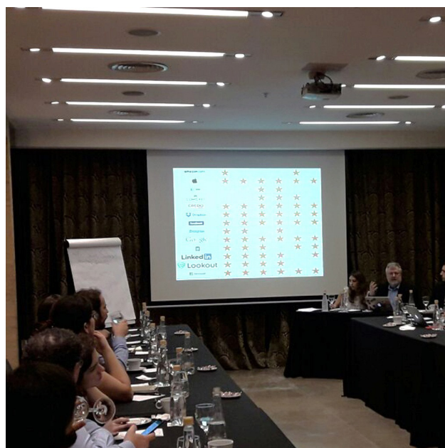
Presentation of Who Defends Your Data?

• Launching event for the report Who Has Your Back? Throughout 2017 we prepared the Argentine edition of the regional study led by the EFF about policies and practices of telecommunications providers regarding their users' privacy and personal data. The launching event counted with the participation of industry representatives, the National Directorate of Personal Data Protection, and also journalists and advisors of legislators.