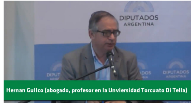
The President of the ADC in the Chamber of Deputies