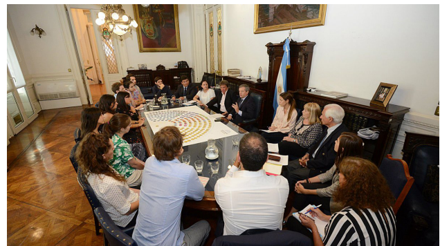
Open Parliament Network meeting in the HCDN