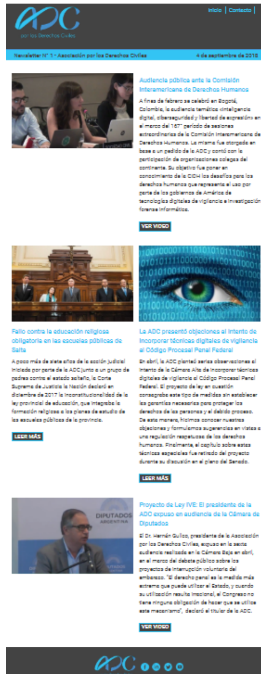
First newsletter of the ADC

• Additionally, 2018 marked a significant growth concerning the presence and scope of the ADC on global networks. Between the first and second half of 2018, the total amount of interactions on Facebook as well as on Twitter increased by a 34 percent, while (organic) impressions increased by 29 and 42 percent, respectively. On the other hand, the ADC is also present in Instagram since July. Through that service, we regularly share updates on our activities too.