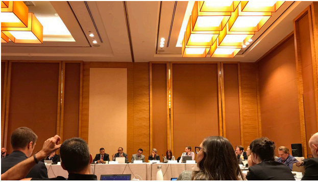
Global Forum on Cyber Expertise