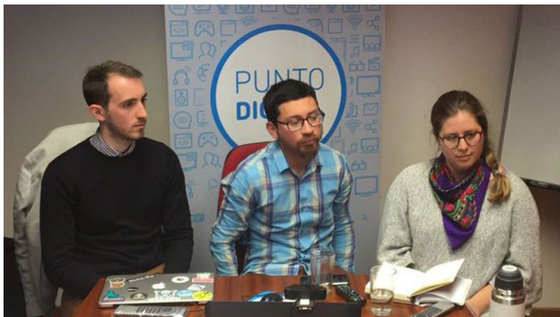
ADC researchers in the series of videoconferences